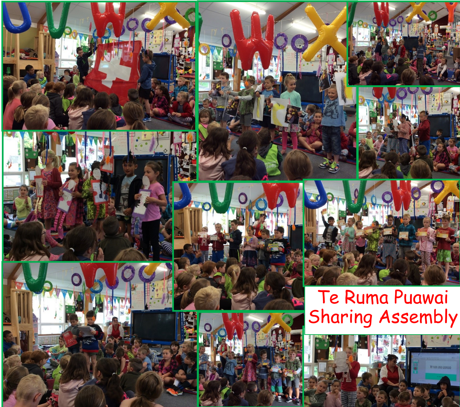
Te Ruma Puawai Sharing Assembly